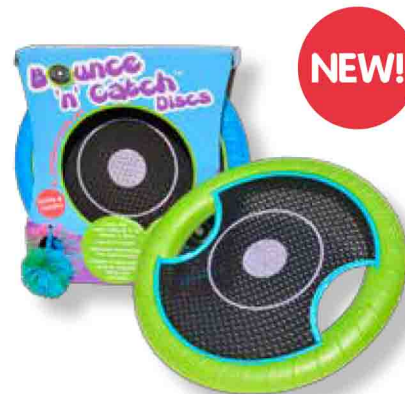
Bounce n' Catch Discs See page 13

Our knowledgeable and friendly team will be pleased to help with whatever queries you have so please get in touch.